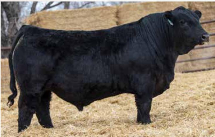
R PLUS YUMA Maternal brother to Lot 330