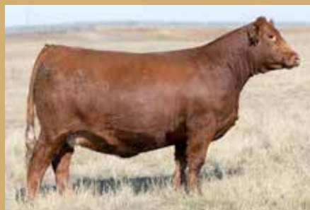
MAF Montana 253H - Daughter