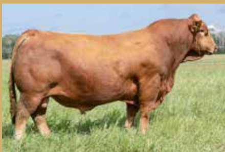
Springcreek Launch 110E - June 2021

CAN - 104 doses | Exportable CAN/USA - 326 doses | Exportable CAN/AUS - 431 doses | Stored at Bow Valley Genetics