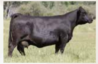
Muirheads Gemstone 2B