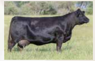
Dam of Lot 160