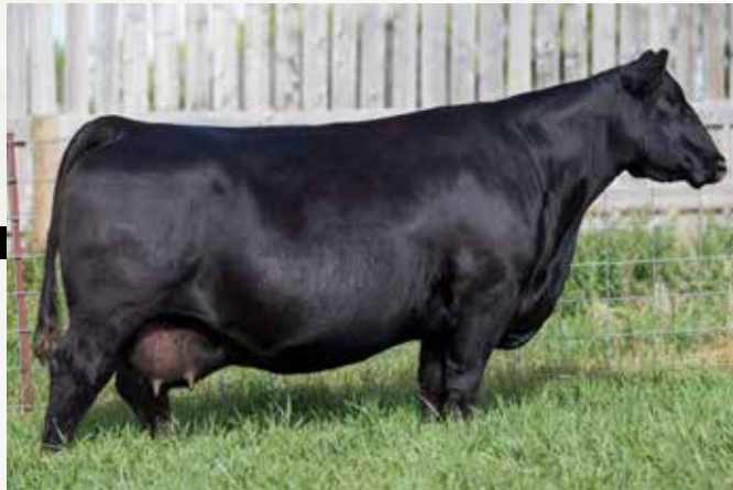
S A V Duke Girl 8161

We purchased a package of Angus embryos off the SAV Duke Girl 8161 cow from Brooking Angus. A little bit of a mixture here from the different sires but included are performance types as well as calving ease and a Renovation female that should be a home run female. If you utilize Angus genetics, be sure to check out these highly sought-after genetics.