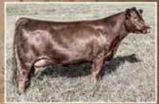
HLTS SAMMIE (WS BEEF KING) Dam of Rancher