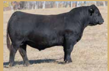
MAF Rolex 151H - Son