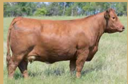
MAF Pashmenia 19G - Daughter