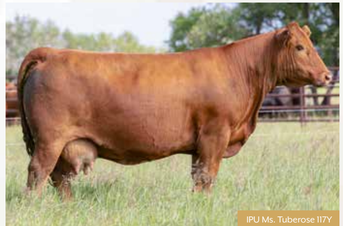
IPU Ms. Tuberose 117Y