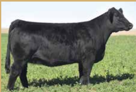
TKCC VICTORIA 57A - DAM

I have told the story of Exclusive many times. At the time of purchasing the Canadian Semen Rights on him it seemed like a big chance we were taking. What didn't take long to figure out was that it was the right decision and that has become more solidified with each new milestone we meet with Exclusive's breeding here. As you will find throughout the catalogue the Exclusive progeny are setting up for big things. The females are beautiful with excellent udders and the bulls are masculine, stout and they are structurally sound. He is a sire that adds style, presence, foot quality, udder quality and moderate birth weights. We have found that he did work best on bigger framed cattle, as he moderated frame more than we originally expected. This was the first spring we did not AI to him, as we chose to move forward with his genetics and capitalize on what we feel is his most outstanding son to date, MAF Rolex. Exclusive is a bull that we believe will provide a strong foundation and useful qualities that will never go out of style.