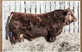
SVS TYCOON 841F Sire of Rancher

The $110,000 phenom that is one of the most exciting bulls to sell in the breed in 2020. Rancher has large, dark, impressive feet and is out of a near perfect, awesome udder donor who is beautiful in her design. His now deceased sire is the hottest bull in the business and we feel Rancher could be the most exciting power bull in our sire line-up.