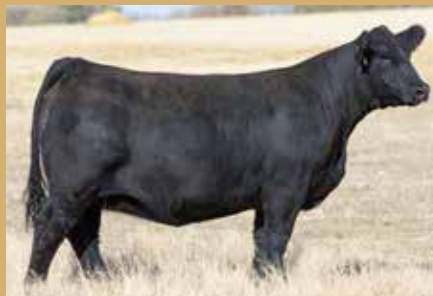
MAF Sabrina 5H - Daughter